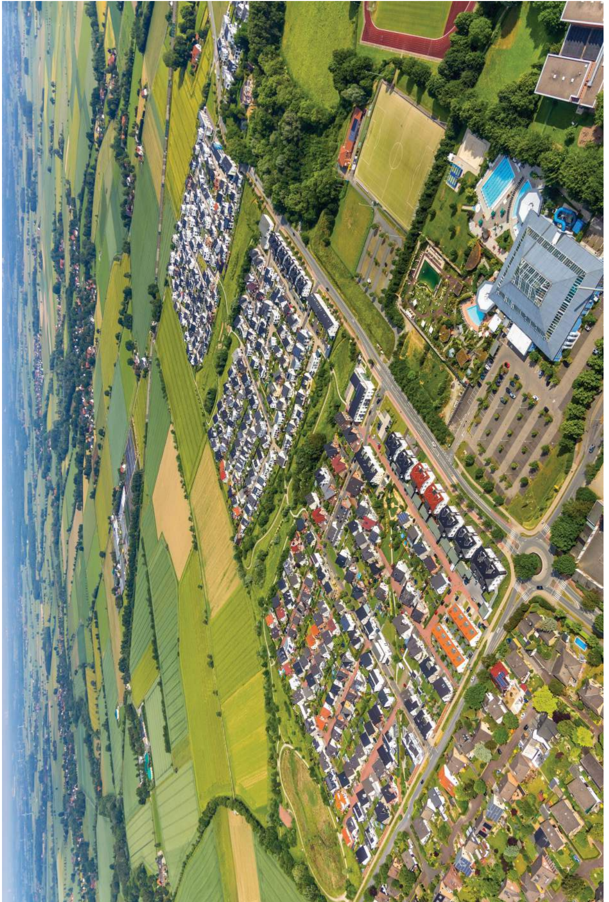
Fig. 3.1 for Question 3 Suburban development in Soest, Germany, an HIC in Europe